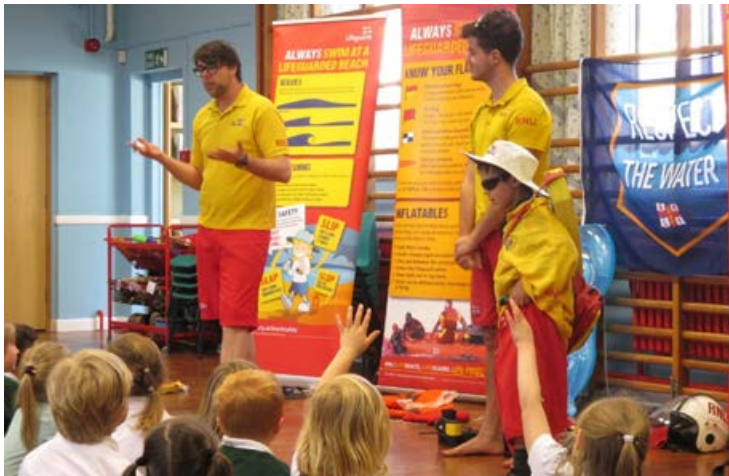
Visitors from RNLI talking to our younger children

Our Year 6's celebrated finishing their SATs tests with a fun activity day and they are now looking forward to their residential visit to Barton Hall, Torquay and taking part in many activities including abseiling and raft building as well as rehearsing for their production of the musical 'Oliver' which they will be performing at the end of term.