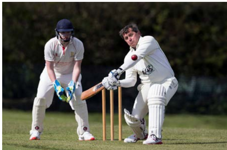
Marnhull start the season with a comfortable win over Blandford.

The Marnhull Messenger respects the privacy of organisations and persons who submit information for publication. Personal details, including photographs, will only be published if approved and submitted by organisations or individuals. No personal details will be given out or sold to any third parties, whether individuals, organisations or companies.