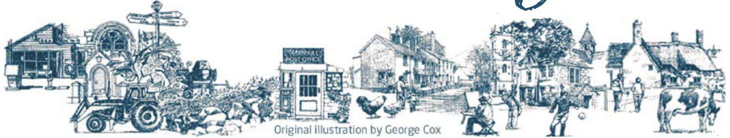
Original illustration by George Cox